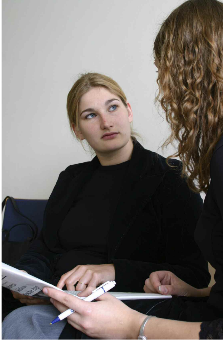
Only after parties are brought into a joint session can the mediator be sure that the preparation during the pre-caucuses has been adequate.