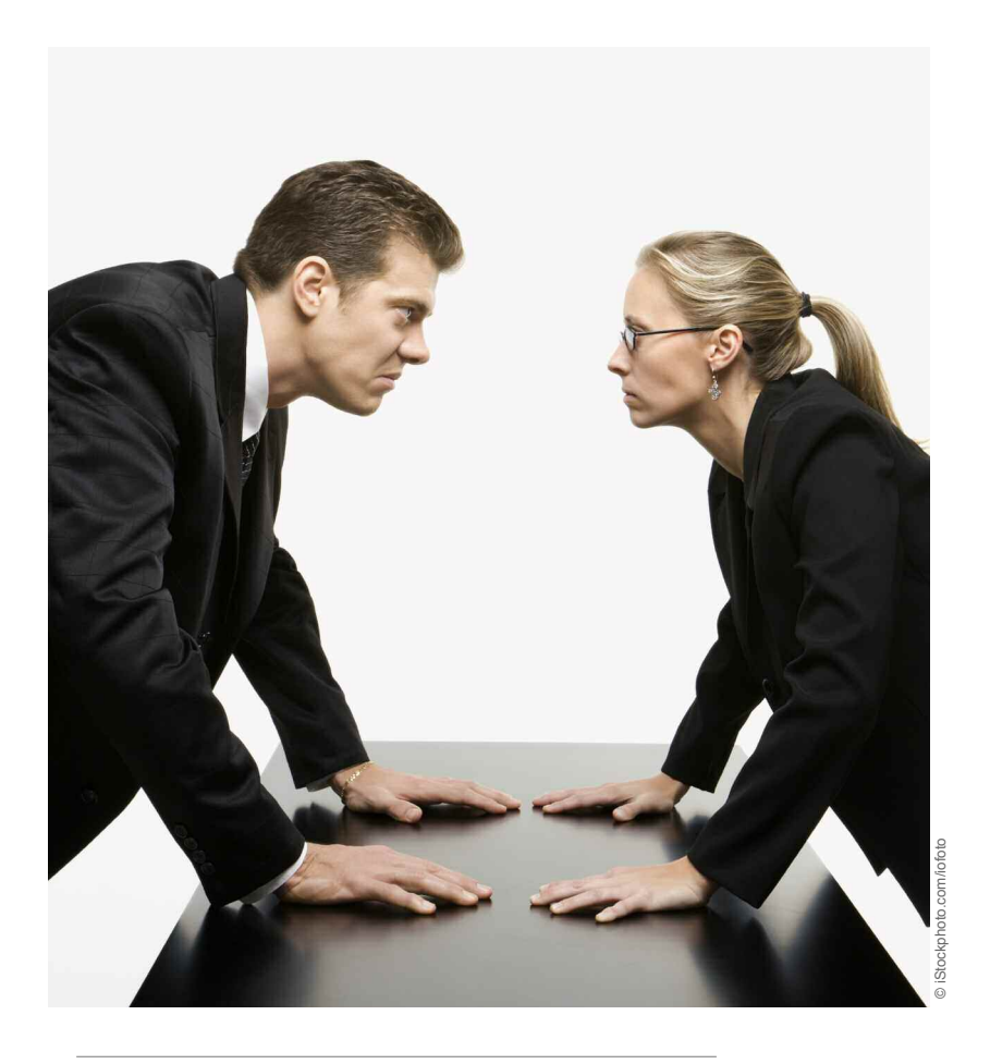
The noninterference model can be pushed beyond its useful limits.

of the easy joint sessions described earlier in the book, in which the mediator only had to introduce the next topic and write down areas of agreement.