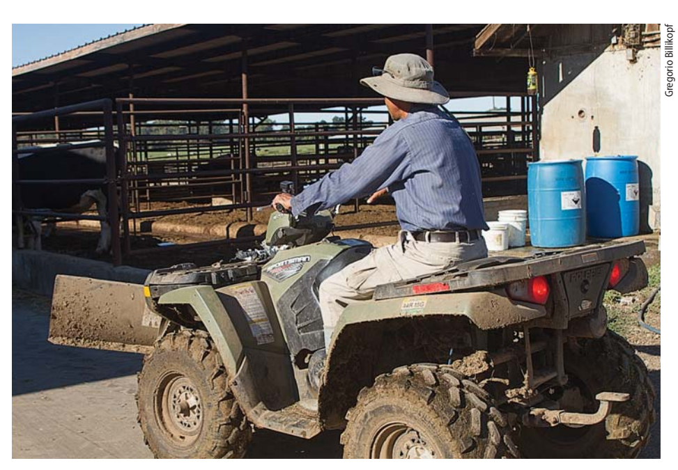
The average length of dairy employment was 6.6 years; the range was from 2 weeks to 40 years. The average number of jobs among people with previous dairy positions was three.

Using the snapshot approach, the average length of employment at the time of interview was 6.6 years, and the range was from 2 weeks to 40 years. By contrast, when we used the completed-tenure approach, the average length of employment was only 3.5 years. The subset of subjects without previous dairy employment (n =92), who would not have been interviewed if we had used only the completed-tenure approach, had an average length of employment of 7.1 years, and the range was from 5 weeks to 40 years. The subset of subjects with previous dairy jobs (n = 114) had an average length of employment of 6.2 years. On average, these subjects had held three dairy positions, that is, the present job plus two more. As Billikopf noted in 1984, there is great variability