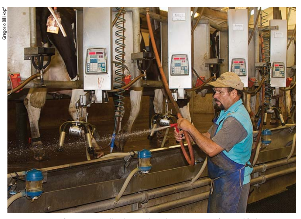
In a recent survey of San Joaquin Valley dairy workers, the reasons most often cited for leaving employment were compensation and benefits, economic problems at the dairy, and personal and family matters.

Eighty-eight percent (n = 183) of the subjects were Hispanic and 12% (n =26) were white (of the latter, 81% were Portuguese). The average worker was 36 years old; the range was from 19 to 69.