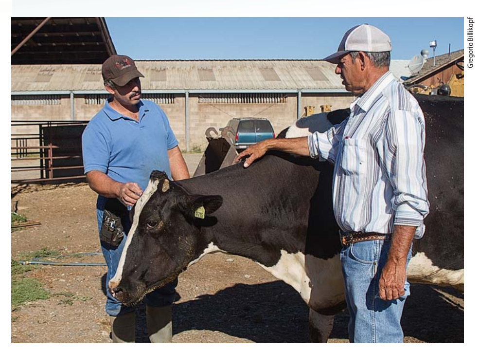
Dairy production cannot be readily downsized in response to labor shortages, making employee turnover an ongoing management concern.

Dairies are labor intensive because cows are milked two or three times per day year-round. Excessive employee turnover is expensive and upsets routines, which in turn can affect animal health and dairy productivity. By all accounts, 2009 was the worst year since the Great Depression (Willis 2009) for U.S. industries, including dairies (Barrett 2012). As a recession intensifies, the number of employees who voluntarily quit generally goes down while the number of terminations increases. Using Bureau of Labor Statistics data, Hill (2011) showed exactly that pattern between 2007 and 2010, with 2009 as the peak year for terminations and the lowest year for voluntary quits.