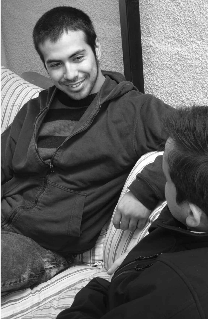
San Javier de Loncomilla, Chile

The key to the NPA is the ability to have this conversation between supervisor and subordinate, which will clarify the needs and expectations of both parties and encourage dialogue, even when the facilitator is not there.