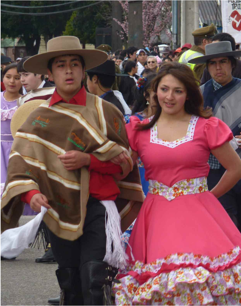
© 2010 Gregorio Billikopf, Llanquihue, Chile

There are real differences between nations that grant us identity.