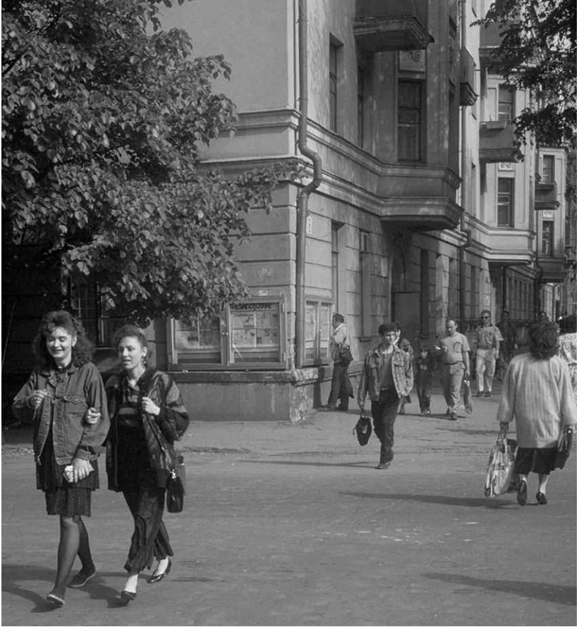
Voronezh, Russia

In Russia, women often walk arm-in-arm with their female friends. In Chile, women regularly greet both women and men with a kiss on the cheek. In some cultures, “yes” means “I hear you” more than “I agree.”