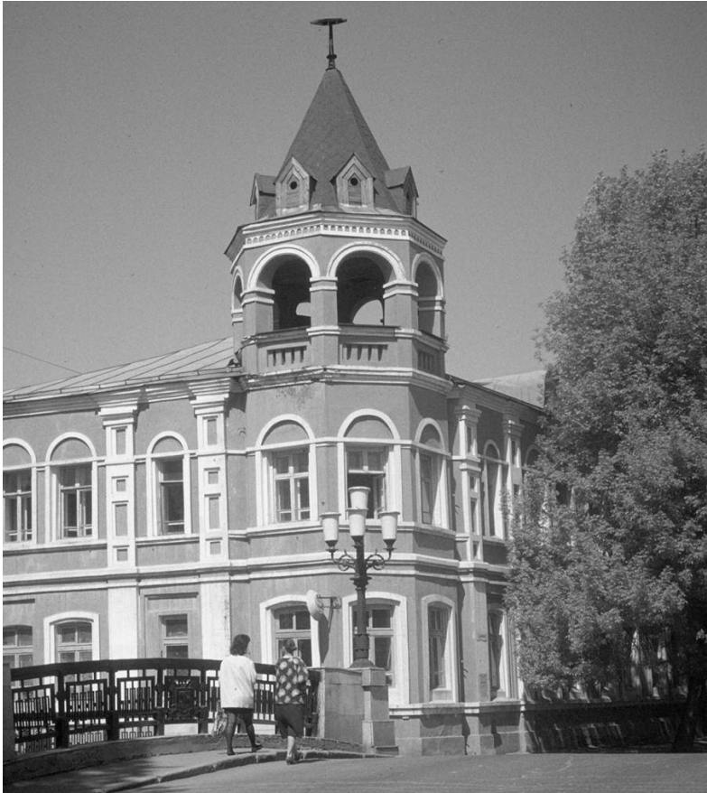
Voronezh, Russia

In 1993, I had my first opportunity to visit Russia as a representative of the University of California to provide assistance in the area of agricultural labor management. “Russians are a very polite people,” I had been tutored before my arrival.