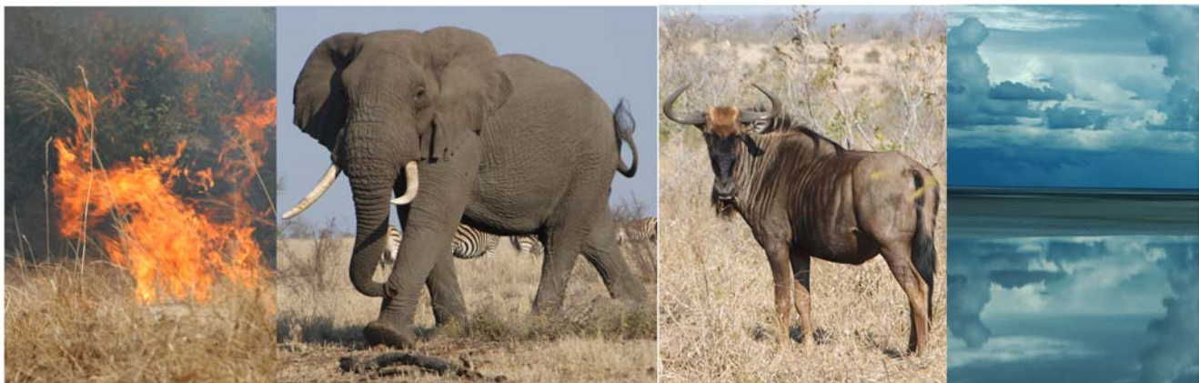
Figure 2. Elephants, fire, wildebeest, and rainfall all have the potential to affect the woody component of African savanna systems. The effect of elephants is through regular browsing and coppicing of trees, fire through episodic burns linked to fuel load, wildebeest after being released from the suppressing effects of endemic rinderpest (a morbillivirus of artiodactyls), and rain through its connections to all system components. Holdo et al. [10] demonstrate that eradication of rinderpest is responsible for the Serengeti switch from a net source to net accumulator of carbon. doi:10.1371/journal.pbio.1000209.g002