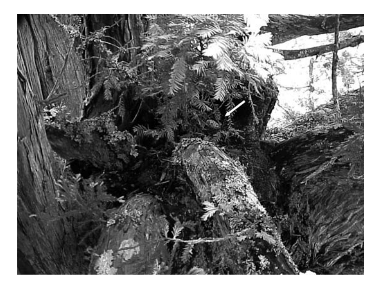
Figure 3. Marbled murrelet nest platform on the broken top of an old-growth coast redwood tree. Note the egg, marked by the white arrow, in the middle of the picture beneath the epiphytic redwood sapling.

of the 5 random dominant and subdominant trees measured for 13 nest and random sites (all P values > 0.05).